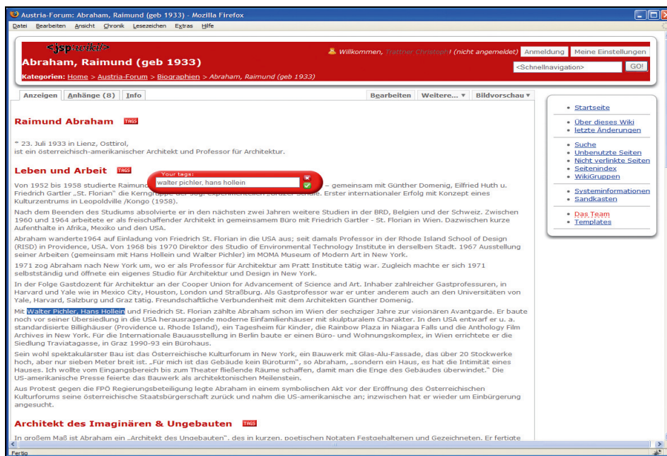
Figure 1: ST form module

The actual centerpiece of the ST module is a unit called ST plug-in. It loads and manipulates the data from the ST data storage backend module, extracts user data from the ST security module and handles data sent by the ST form module via XMLHttpRequest (see Figure 2).